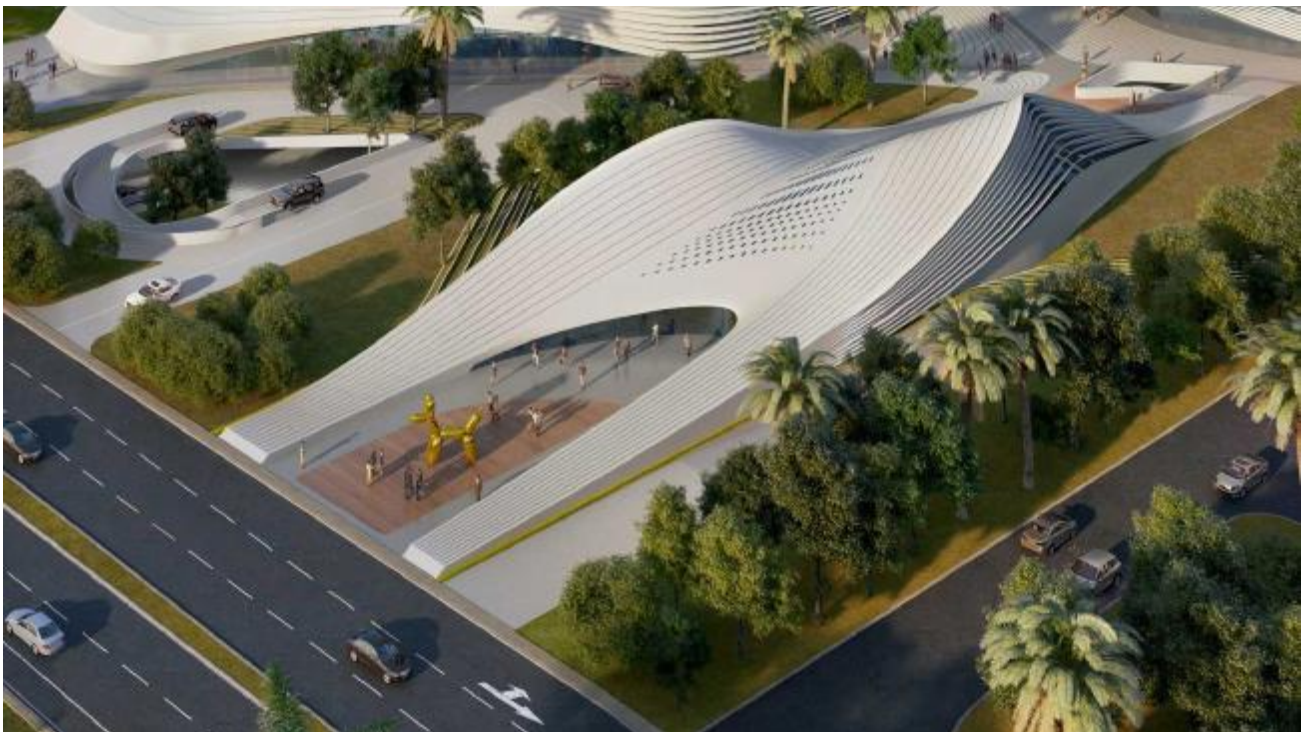
📷 An artist's impression of Mariner's Cove.