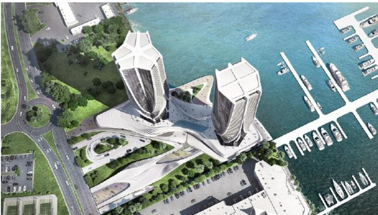
An artist's impression of Mariner's Cove.