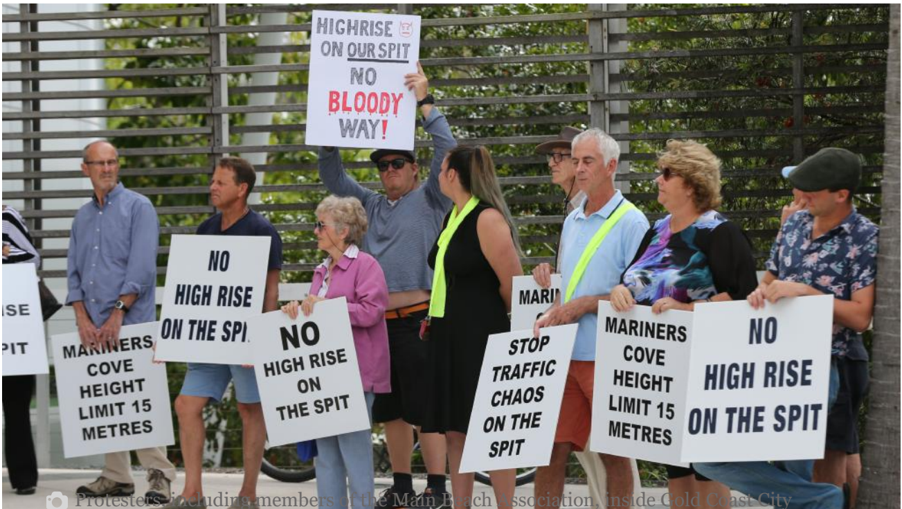
Protesters, including members of the Main Beach Association, inside Gold Coast City Council objecting to Sunlands proposal at The Spit.