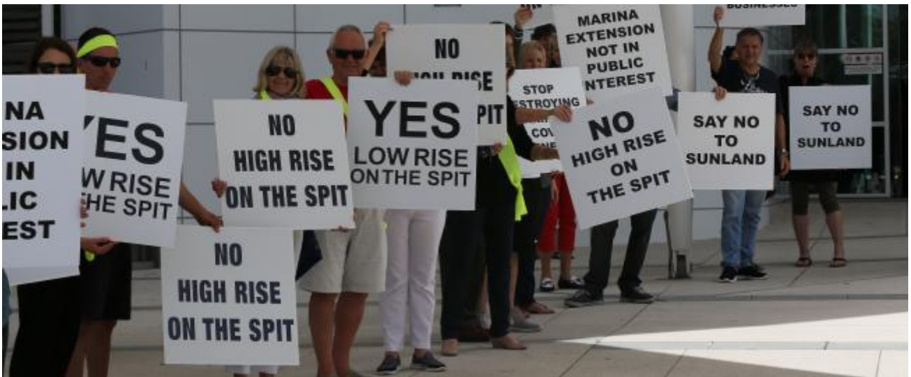
📷 Protesters, including members of the Main Beach Association, inside Gold Coast City Council objecting to Sunlands proposal at The Spit.

It is clear which councillors the group will turn to if they need help.