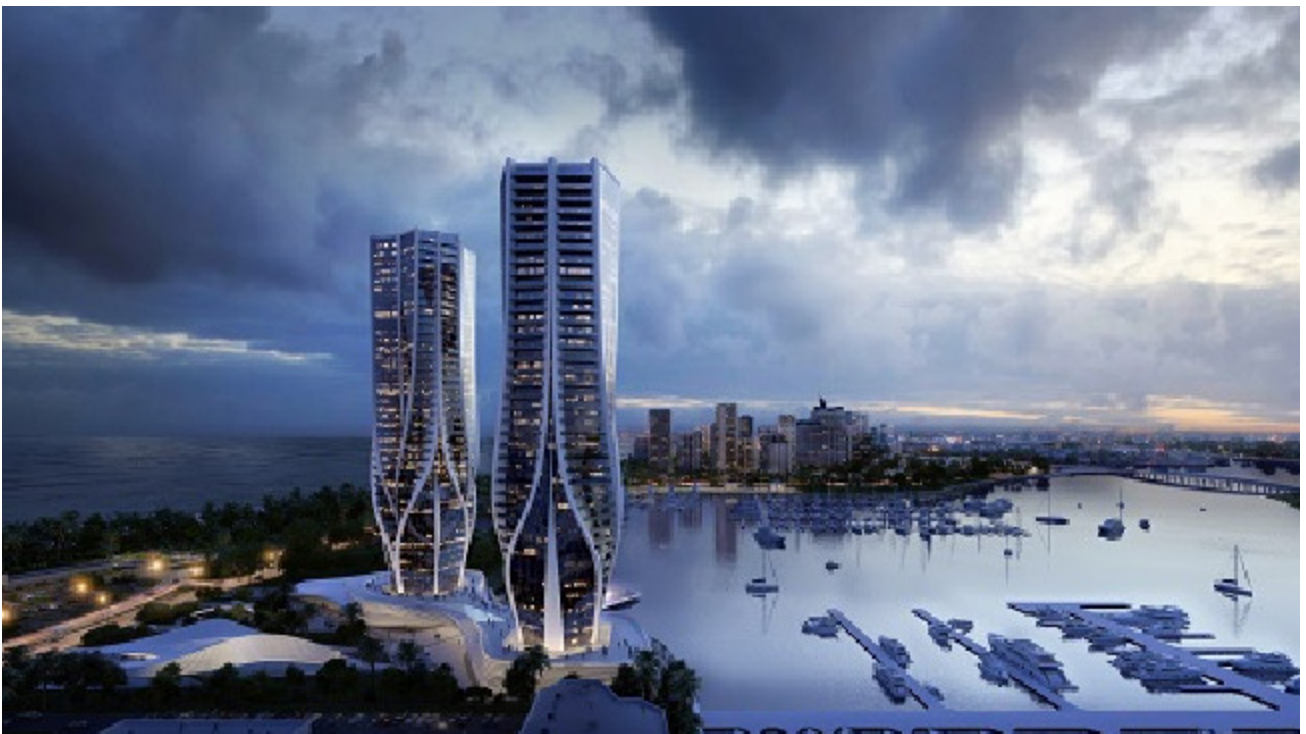
📷 An artist’s impression of Mariner’s Cove.

“It’s not the outcome we would have wanted,” she said.