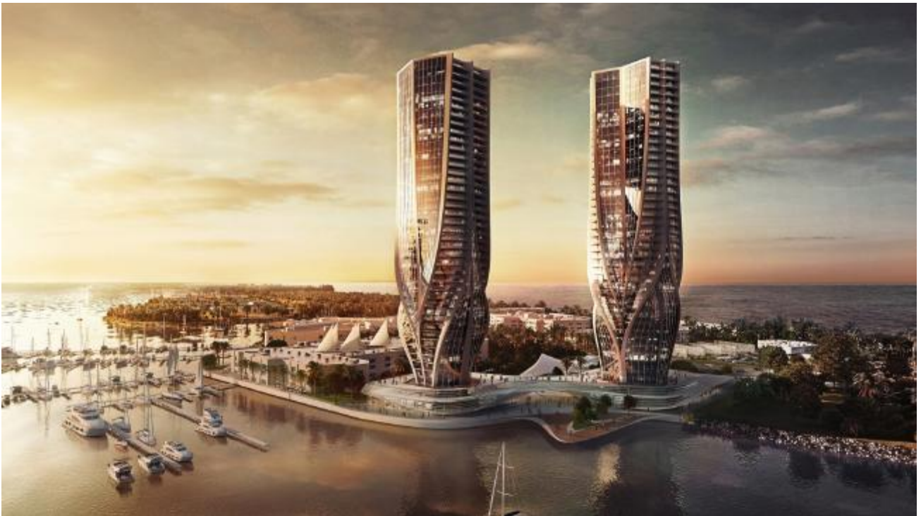
📷 An artist's impression of Mariner's Cove.

“Mr Mayor, let’s make a decision. Let’s not put it off. It won’t go away.