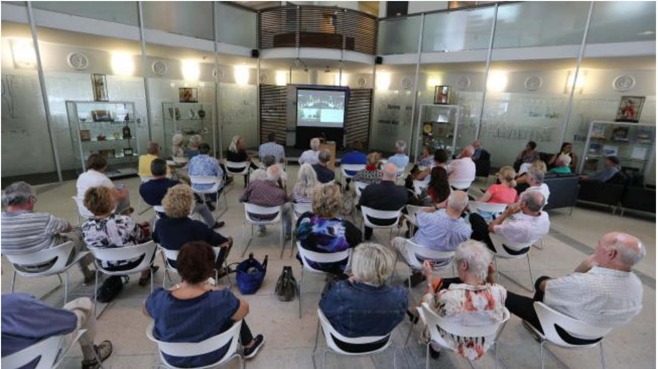
📷 Protesters, including members of the Main Beach Association, inside Gold Coast City Council objecting to Sunlands proposal at The Spit.

At the start of the meeting they packed into the public gallery, spilling into the public foyer where chairs and a big screen live stream was set up.