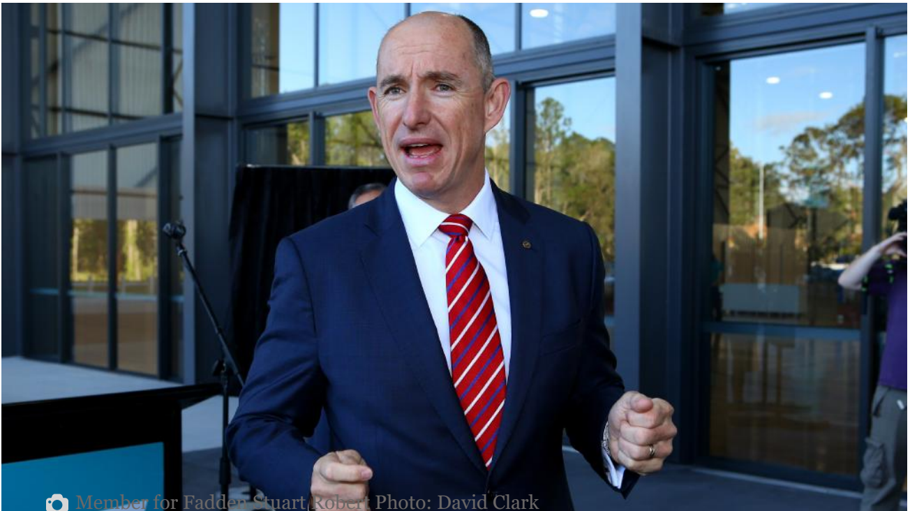
Member for Fadden Stuart Robert